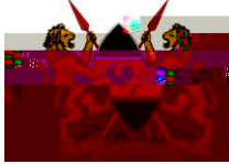
Republic of Kenya