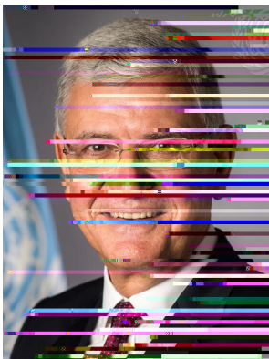
H.E. MR. VOLKAN BOZKIR President of the United Nations General Assembly

global challenges." Mr. Guterres graduated from the Instituto Superior Técnico with a degree in engineering. He worked for the Portuguese Government, including as Deputy Mayor for Culture of Lisbon, and has two children, a stepson and two grandchildren.