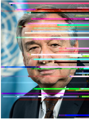
H.E. MR. ANTÓNIO GUTERRES United Nations Secretary-General

H.E. Mr. António Guterres is the ninth Secretary-General of the United Nations. He had a long and distinguished career in public service rooted in one overarching mission: to promote human dignity for all. Whether working as a volunteer in his home neighbourhood of Lisbon or representing his constituency in the Portuguese parliament, and then in his years as Prime Minister to his service as United Nations High Commissioner for Refugees, Mr. Guterres has sought to ease suffering, protect the vulnerable and ensure human rights for all. These priorities have remained the core of his work today as Secretary-General of the United Nations. Since taking