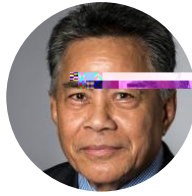
Permanent Representative of Samoa to the UN