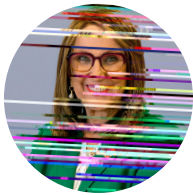
Secretary-General, UN Trade & Development