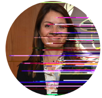
Permanent Representative of Denmark to the UN in New York