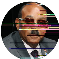
H.E. Gaston Browne Prime Minister of Antigua & Barbuda