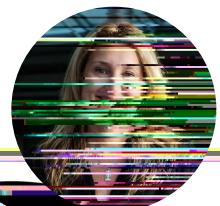
President and Group Director Americas Fugro