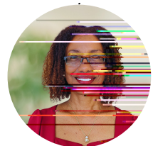
Chair, Caribbean Chamber of Commerce