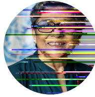
Under-Secretary General, High Representative, UN-OHRLS