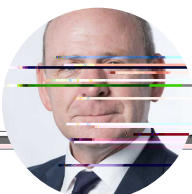
Permanent Representative of Ireland to the United Nations