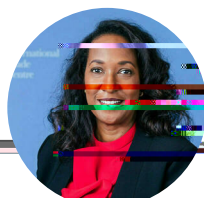
Executive Director International Trade Centre