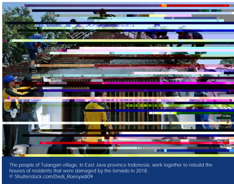
The people of Tulangan village, in East Java province Indonesia, work together to rebuild the houses of residents that were damaged by the tornado in 2018.

While each Government represented has a different national structure, speakers agreed on the importance of inter-ministerial or cross-sector coordination structures. Whether via a single Ministry in the lead, a Disaster Management Agency, or otherwise, coordination on key issues came up throughout discussions. Frameworks and policies were important in facilitating that coordination, but many pointed out that implementation in a whole-of-government and whole-of-society approach supported unified efforts and lowered overall resource costs to prevent, respond, and find solutions for displaced populations. Coordination at the national level on management, finance, technical expertise, and integration with development and services of