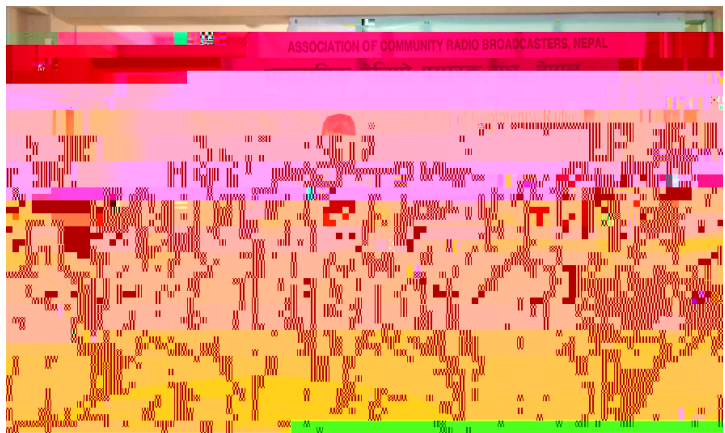
Promoting social accountability of the stations.

Increased the level of understanding among participants on the issues raised by the project. This was documented by the pre and post testing of participants which showed significant improvement in levels of understanding and knowledge. For example, awareness on the importance of human rights rose from 39 percent to 71 percent, understanding the norms of good governance rose from 17 percent to 83 percent, and understanding that ethical journalism was the key to journalist safety rose from 39c6(ng)-658.9 Tm[pe)3(r)-3(cen)3(t)6(2156(un9-8-3(cen)3(t)-4(9 Tm[pe)3(r)-i)-4(pa)4(nt